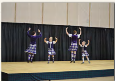
Young Beginner dancers with two Novice dancers filling in.

It's not suppose to happen, but sometimes only one dancer is on stage. For example this can happen if the other dancer decides at the last minute not to go out.