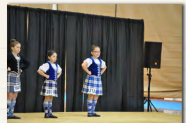
Dancers waiting to begin dancing.